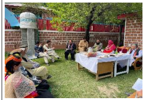
Mashbarai marakha/ FGD PCMC ani mocan som zhe aan BHU una krom garaw (2 Kal'as'a LHV an som