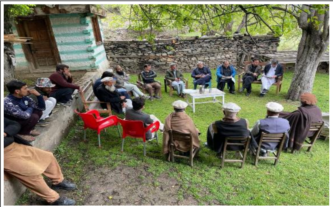
Mashbarai marakha / FGD Patua shek ghrom chom ani puruz'on som