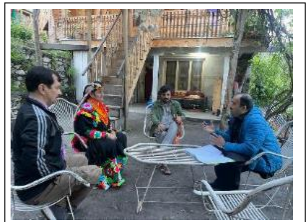
Mumuret desh ani Moashrati krom garaw istryzha Iran Bibi a som jhonaw mocan Mashkulgi zhe sihat as t'im as grup phut'u