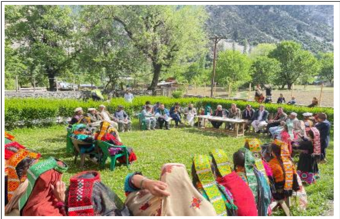
FGD Ghrom Anish zhe Brun'a' ghrom chom ani istrizhon som