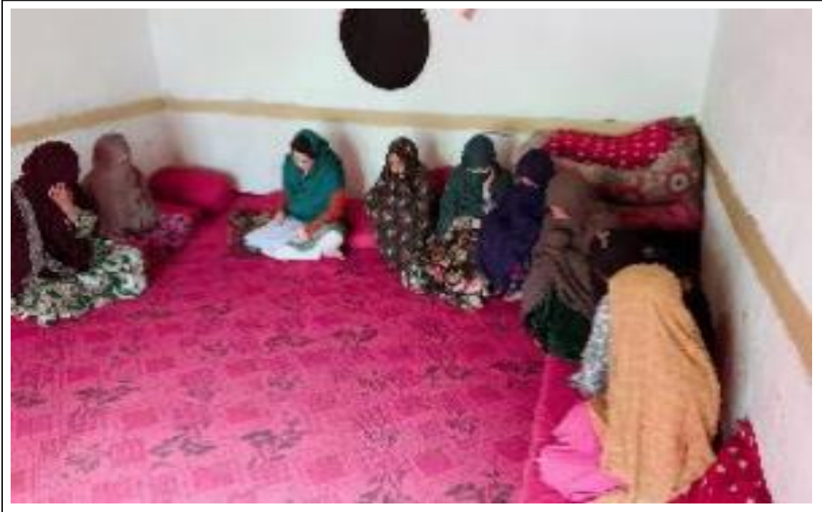
Mashbarai marakha / FGD Patua shek ghrom chom ani istrizhon som