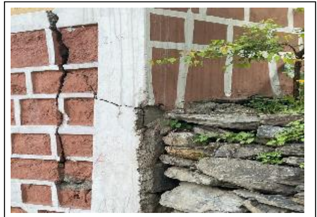
BHU Mumuret as pis't'aw dhiga' as hatya nuksan