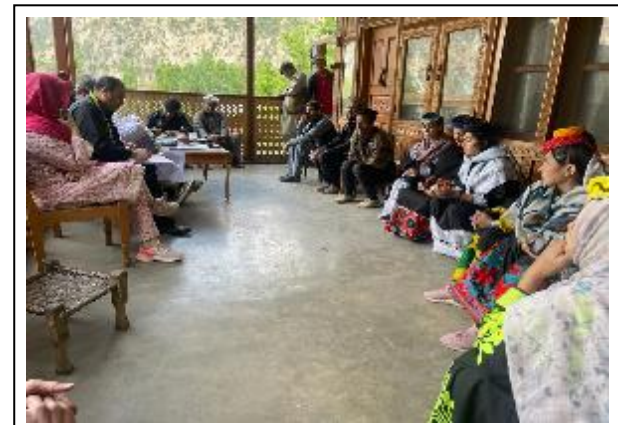
Mashbarai marakha / FGD Kra'ka' ghrom una Kal'as'a ghrom chom ani mocan som

Cot'ala Po'n' 3: Mashbarai mashkulgian Phut'u/ FGDs Munakit aran