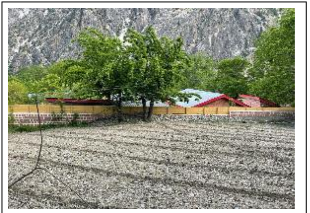
BHU as pis't'aw chelak ani ek warek manzar , kis'ikas zemin pashel dai. Zahiri Sihat as khial as suklat as pis't'aw digha' as ghen d'aran as uk ik aam mondr --Mumuret

Phut'u mucik mocai buchum dhen'taw ugas zaria Pashel dai, d'aran as ugas aam phon'd asta pashel dai (zariauna saihat as khial as suklat as ghen yao BHU Mumuret as ghen pariw dai